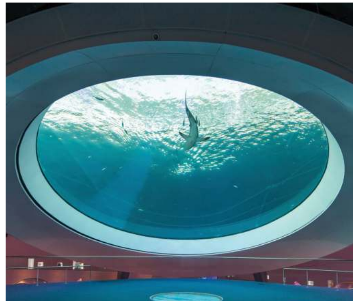
FROST SCIENCE MUSEUM