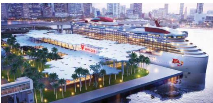
VIRGIN VONAGES CRUISE TERMINAL