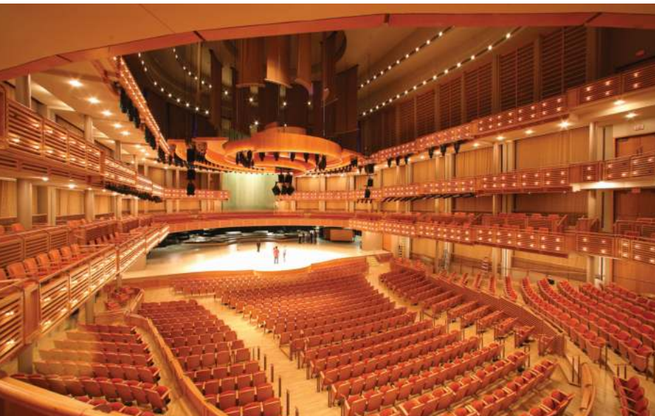
ADRIENNE ARSHT CENTER FOR THE PERFORMING ARTS OF MIAMI

A pair of glass towers with flowing design profiles rises high above Miami's chic Edgewater neighborhood. Directly on the shores of Biscayne Bay and surrounded the bustling Downtown and Brickell city centers, Design District, Wynwood, Midtown, and Miami Beach. Aria Reserve is immediately recognizable, yet feels like a private estate hidden away from the rest of the world.