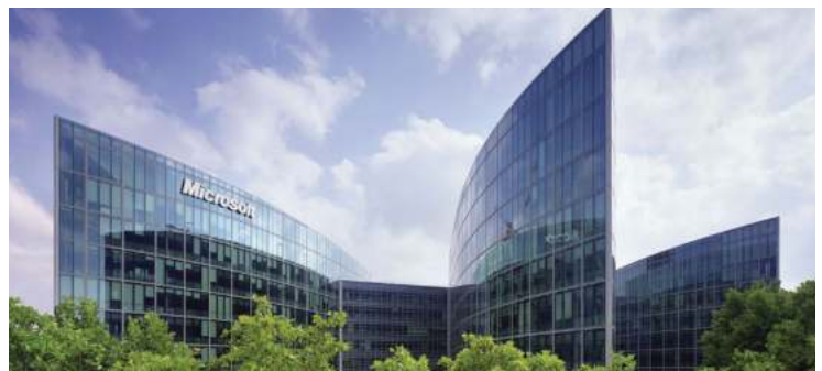
MICROSOFT EUROPEAN HEADQUARTERS